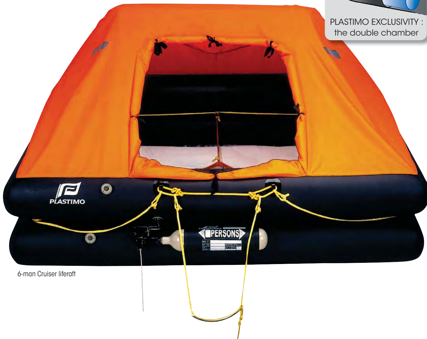
6-man Cruiser liferaft